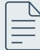
Supplied with a Certificate of Analysis