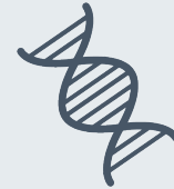
Determine the presence of aspergillus DNA