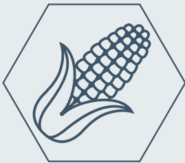
Sample Homogenization and Grinding