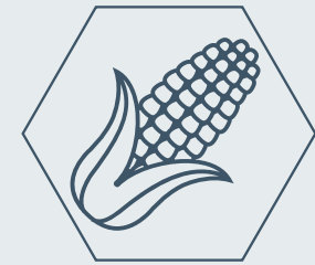
Sample Homogenization and Grinding